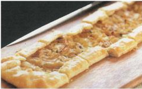
Caramelized Onion and Thyme Tarts