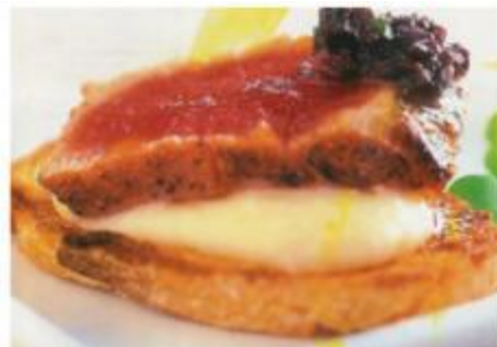
Rare Tuna Crostini