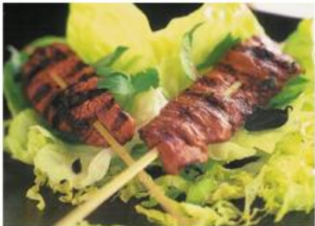
Grilled Skirt Steak