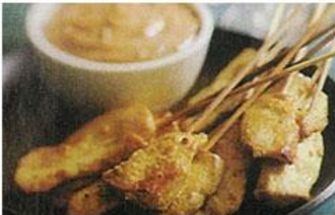
Chicken Satay with Spicy Peanut Sauce