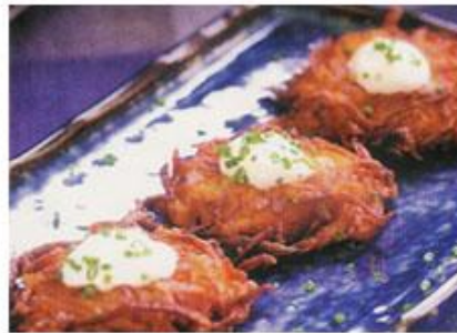
Mini Potato Latkes