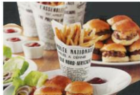
Fries in a cup | Mini Burgers with Pimento Cheese