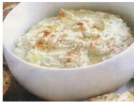
White Bean and Artichoke Dip