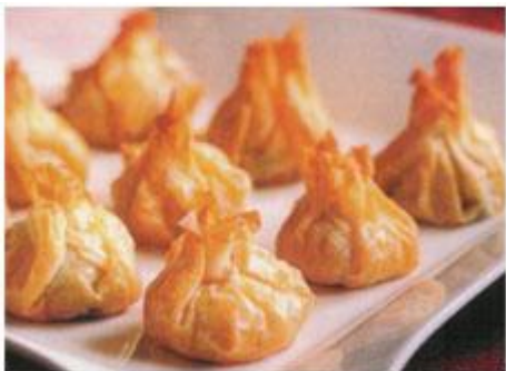
Spinach, Sun-dried Tomato and Feta Purses