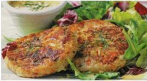
Mini Salmon Potato Patties