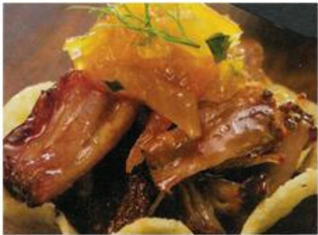
Smoked Paprika Shredded Pork Crisps with Orange Fennel Marmalade