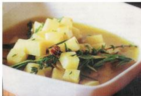
Manchecho Marinated in Olive Oil and Herbs