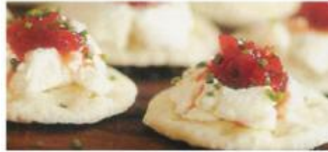
Goat Cheese and Hot Pepper jam on Crackers