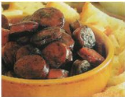
Chorizo with Red Wine