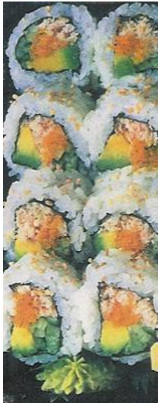
Ocean Crab Roll