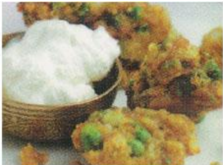
Pea and Potato Pakora with Yogurt