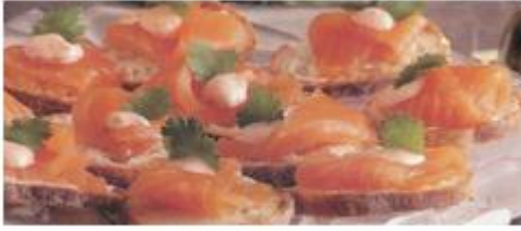
Gravlox infused with Chiles, Cilantro, and Vodka