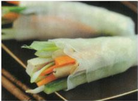
Vietnamese Crystal Rolls