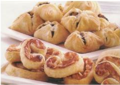
Mushroom and Sun-dried Tomato Pockets | Ham, Gruyere and Honey-Mustard Palmiers