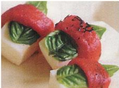
Roasted Red pepper wrapped Mozzarella Cubes