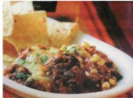
Warm Black Bean and Chipotle Dip