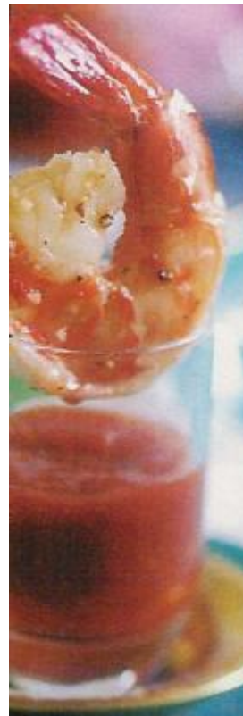
Garlic Roasted Shrimp Cocktail