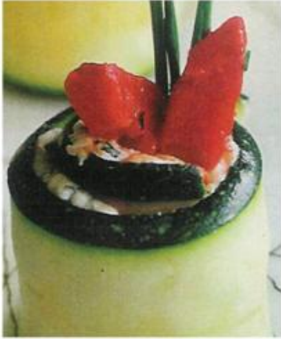
Zucchini Rolls with Herbed Goat Cheese and Red Pepper