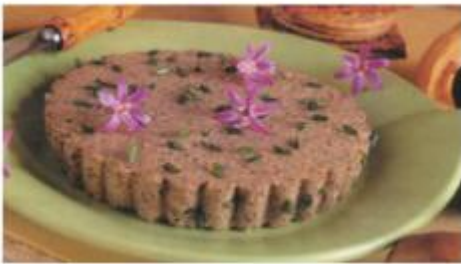
Wild Mushroom Pate