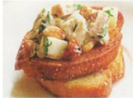
Mediterranean Chicken Salad with Fennel, Raisins and Pine Nuts