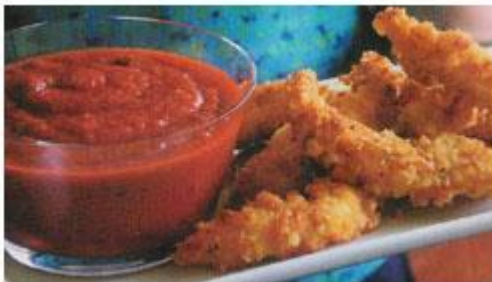
Parmesan Chicken with Marinara Dipping Sauce