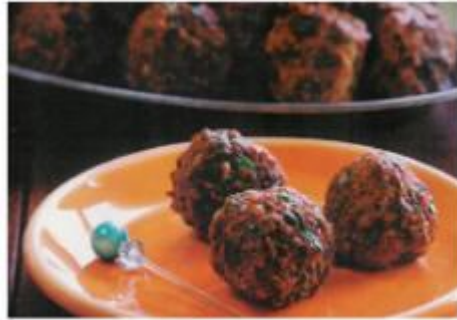
Spiced Mediterranean Meatballs