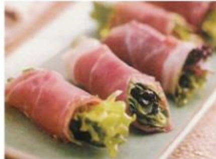
Prosciutto wrapped Mesclun and shaved Parmigano- Reggiano