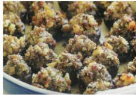
Stuffed Mushrooms with Pancetta, Shallots, and Sage