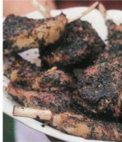
Grilled Lamb chops with a Rosemary and Sage Crust